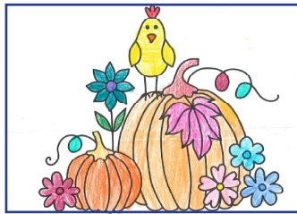
5 - 8 years Lydia S. Greer, SC