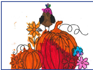
0 - 4 years Liam K. Duncan, SC